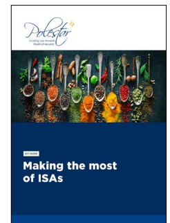
Making the most of ISAs

Call us now for further information or advice