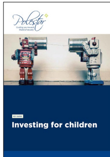
Investing for Children