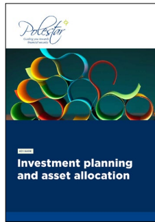
Investment planning and asset allocation