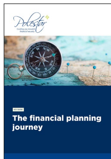
The financial planning journey