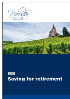
Saving for retirement