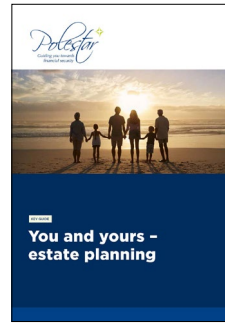
You and yours - estate planning