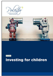
Investing for Children