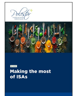
Making the most of ISAs

Call us now for further information or advice