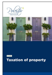
Taxation of property