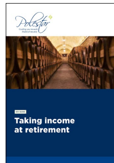
Taking income at retirement