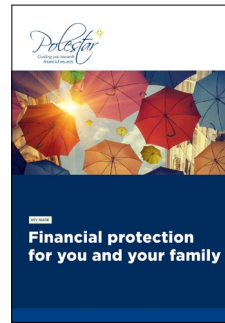
Financial protection for you and your family